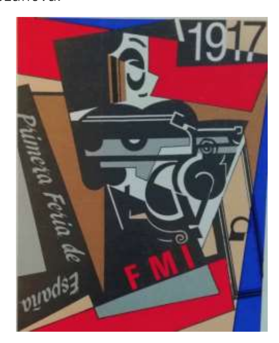
Fig. 12. Paco Bascuñán: Christmas greetings card on Juan Gris (Feria Muestrario Internacional de Valencia, 1989) - Arxiu Valencià del Disseny –

There are some graphic design works in the Paco Bascuñán legacy to the Valencian Archive of Design that can serve as examples of the postmodernist and expressive ways in which Paco Bascuñán conveyed iconic motifs taken from the tradition of the modern arts to generate time displacement feelings in brand new contexts. In 1989 Bascuñán received the commission from the Feria Muestrario Internacional (International Exhibition Fair) of Valencia for designing a Christmas greeting card - fig. 12 -. Instead of drawing on religious iconography, he took as a starting point a Juan Gris cubist still life painting dated in 1917 and now in the Minneapolis Institute of Arts. Bascuñán integrated the iconic motif of the guitar of Juan Gris in a new composition which brought back the aesthetic essence of Cubism combined with his new typography. Although the use for which Bascuñán devised his creation was quite different and even contradictory from that of the original artwork, the designer achieved an astonishing plastic coherence. He proceeded in similar ways when creating other Christmas greeting cards for 1990 and 1991 based on the works of Raoul Hausmann and Olga Rozanova.