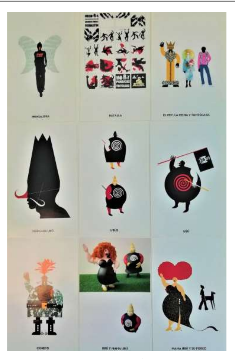
Fig. 13. Paco Bascuñán: Ubu roi postcards (Teatres de la Generalitat, 2005)