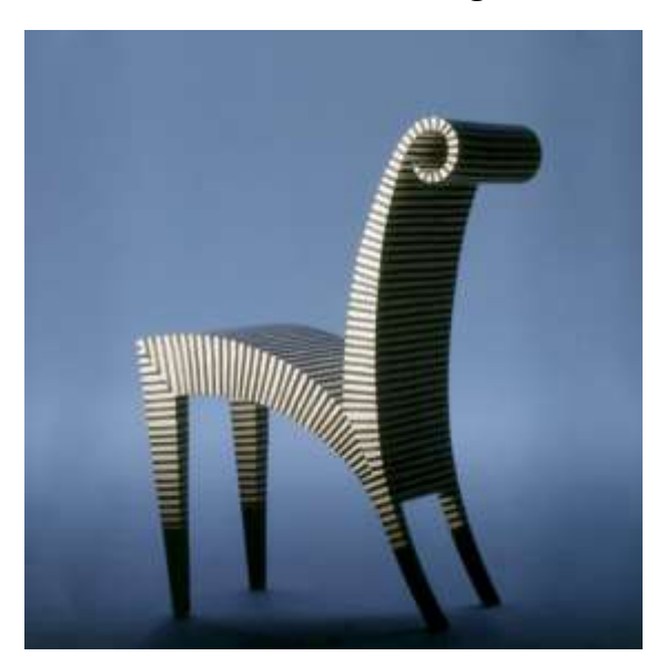
Fig. 5. José Juan Belda: Cebra chair (Luis Adelantado, 1987)

For me, design has two very different fields. A technical one, in which strictness and functionality must prevail, as in the case of a tool, a wheelchair or an electrical appliance and another "sumptuous", such as a piece of furniture, a coffee set, a lamp. ..where ergonomics and technology can coexist, with the emotions. (Gámez, Yuwang 64)