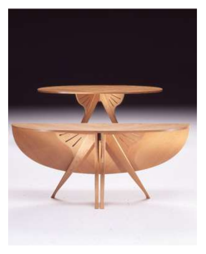
Figure 2. Lola Castelló and Vicent Martínez: Papallona table (Punt Mobles, 1991) - Arxiu Valencià del Disseny –

dining table when the round tabletop unfolds. When folded, this piece of furniture turns into a console table that is placeable just against the wall. Increasing furniture's capability was nothing new but achieving a high degree of functionality through driving the figurative inspiration in nature to a brilliant mechanical solution was a worthy innovation. The shapes of the brackets connecting the legs to the top mimic the wings of butterflies as an iconic sign. Both structural elements can rotate to support the circular surface of the top of the table or just half of it if the other half remains stuck to the wall. The experience of movement enhances the iconicity of the brackets. Thanks to the hinged folding mechanism in the upper central joint, the tabletop also acts as another iconic sign by suggesting the formal symmetry and the articulated motion of the butterfly wings. The double functional features of the table correspond to a duplicated iconical relationship between the table and its natural referent. There seems to be a contradictory interplay between the notion of stability inherent in the semiotics of the table and the experience of mobility when manipulating the object. Nevertheless, the symbiosis between natural/cultural realms and table/console typologies extends the signification of this piece of furniture from double semantics to double semiotics.