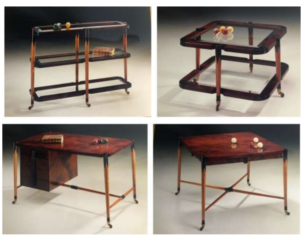
Fig. 10. Pepe Benlliure: Mil bolas pieces of furniture (Baixauli, c. 1985)

designed a set of pieces of furniture for bedrooms, lounges and dining rooms with a clearly iconic inspiration: Mil bolas ( A Thousand Balls ) inspired by the elements of the pool game - fig 10 -. Like an obsession, the forms and figures of balls, sticks and pool tables were reproduced and adapted to side tables, dining tables, consoles, cupboards, wardrobes or beds, all of them meant to occupy almost every corner of the house. The designs of Benlliure got rid of the woodcut procedures, but some of his pieces of furniture still blended industrial and traditional craftsmanship processes since they were made of precious woods and required high-skilled workers able to deal with cabinetmaking and inlay techniques.