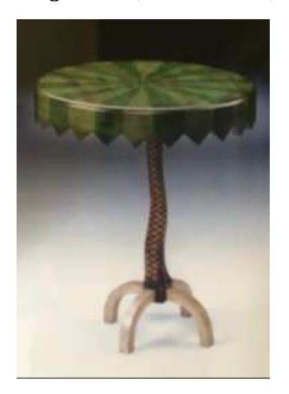
Fig. 11. Pepe Benlliure: Palmera side table (Baixauli, c. 1990) - Arxiu Valencià del Disseny –

experiences of the daily domestic life with a dense net of ambiguous and unexpected suggestions: a ludic activity in every room of the house or a tree growing indoors from the floor. He put into practise the postmodernist conception of interior design: "What differs postmodernist interior space from the modernist space is that the modernism considered space homogeneous in every direction, abstract and rational whereas postmodern interiors are heterogeneous, irrational and ambiguous." (Güven 32-33).