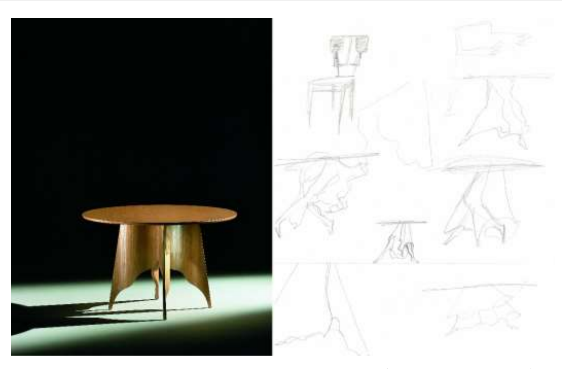
Fig. 3. Lola Castelló: Carmen table (Punt Mobles, 1990)